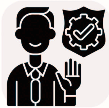
Transparency & Integrity